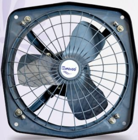
SIZE - 9" REVERSIBLE